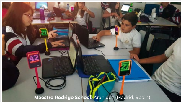
Maestro Rodrigo School. Aranjuez (Madrid, Spain)

*Pérez Galdós Public School. Fuenlabrada (Madrid, Spain)